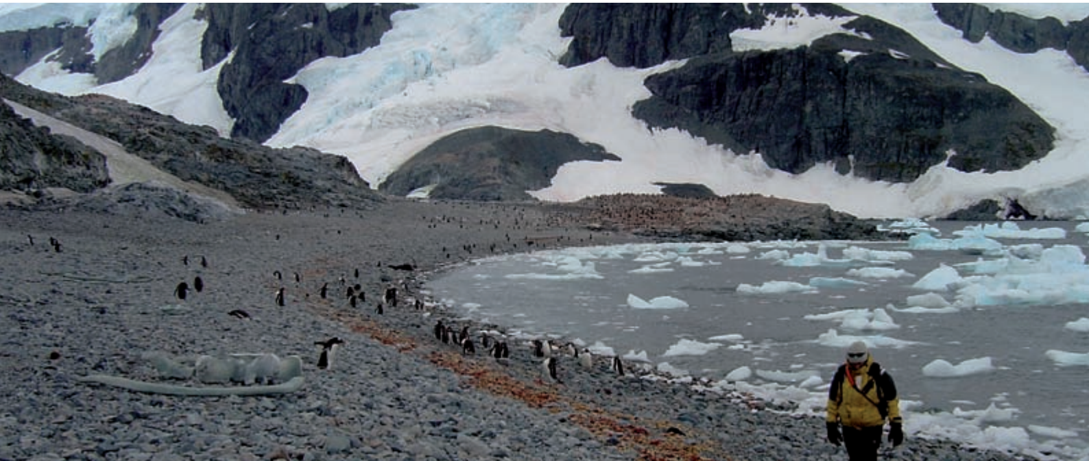
Cuverville Island landing beach

In the late season (moulting time), the density of penguins will probably confine visits to the immediate vicinity of the landing beach.