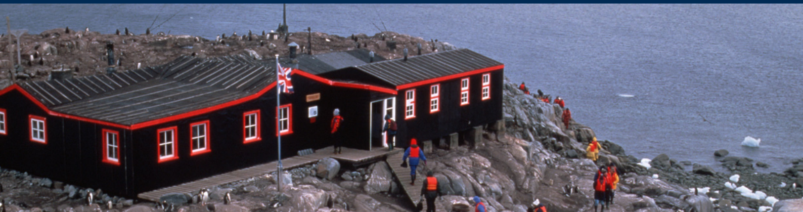
'Base A', Goudier Island, Port Lockroy

64°49'S, 63°29'W - Located in Port Lockroy on the western side of Wiencke Island