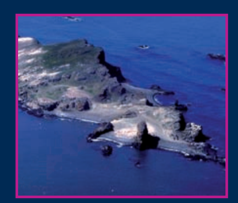
Hannah Point from above

The primary landing beach may be crowded with wildlife – under such circumstances it would be mot possible to make a landing and maintain the required precautionary distances. Both landing beaches are prone to swells. Be careful near the jasper dyke. It is brittle and may crumble. Exercise particular caution not to disturb animals near cliff edges. If they are disturbed, they may retreat and fall.