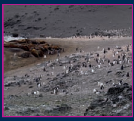
Caution - restricted visitor space and dense concentrations of wildlife