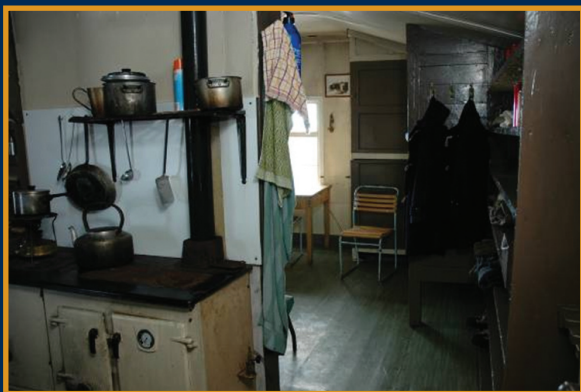
The kitchen and the living and bunk room area beyond