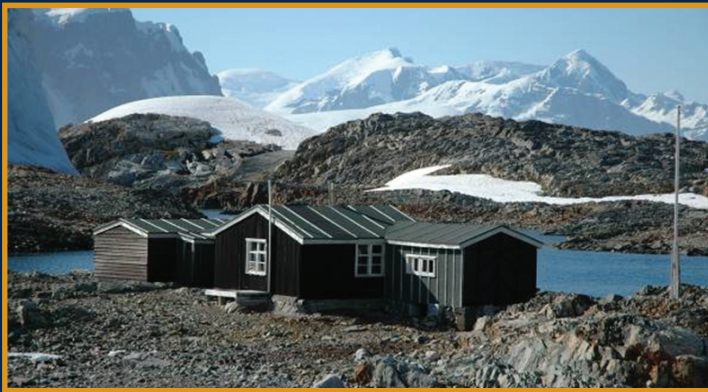
The hut seen from the north and showing the various different builds

The rocks at the landing site can be slippery when wet.