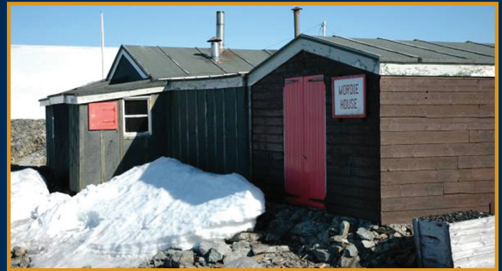
The hut seen from the south showing how close it is built to the sea