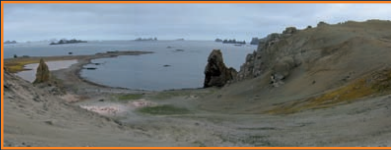
Barrientos Island western landing area

Stay clear of cliffs and vertical walls and stacks as these are prone to rock falls and slides.