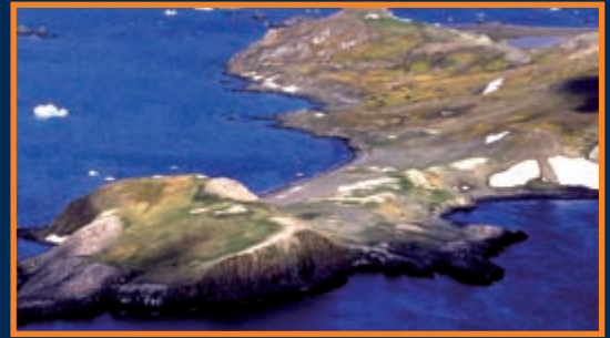
Barrientos Island eastern landing area