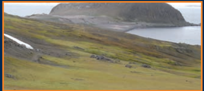
The centre of Barrientos Island is covered by a very extensive moss carpet