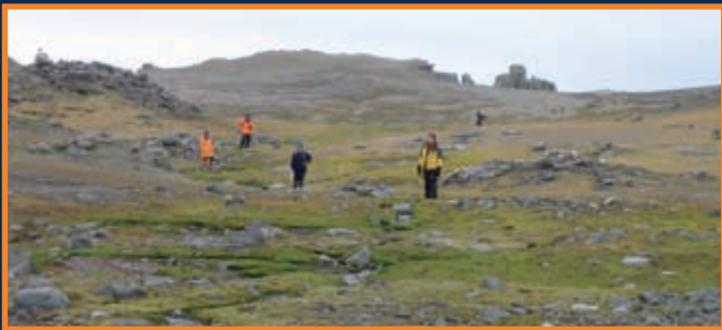
Only walk through Closed Area B if you can clearly recognise the route