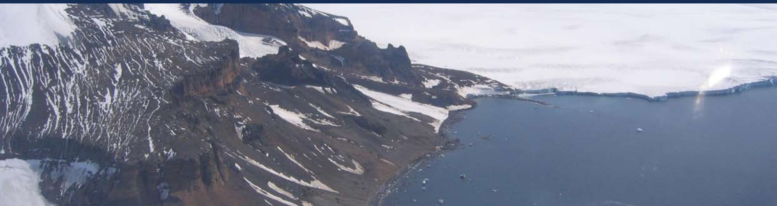
Aerial view of Brown Bluff

63°32'S, 56°55'W - East coast of Tabarin Peninsula on the south-western coast of Antarctic Sound.