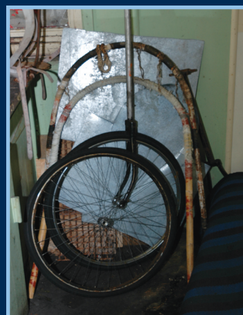
Bicycle wheels used to make sledge meters to measure the distance run