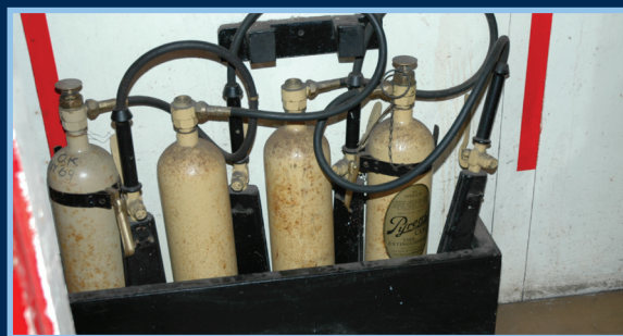
One of several sets of original fire extinguishers