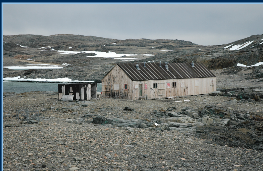
A view of the Hut from the North East with a kennel in the foreground

The rocks at the landing site can be slippery when wet.